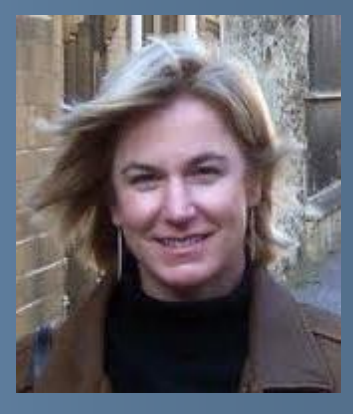
M. B. McLatchey Humanities

Assess the effectiveness of teaching methodologies in traditional classrooms, in military-only classes, in hybrid classes and in faculty learning groups.