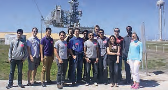
Preparing the DBF aircraft for test flights.