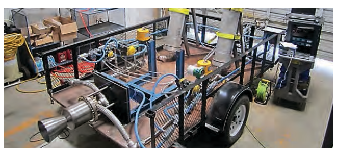
Icarus mobile rocket engine test firing platform rocket engine ground test unit. The engine will be fueled by ethyl alcohol – a "green" propellant produced from

The Icarus II sounding rocket project differs from the original in that its liquid propellant propulsion system is designed, built, and tested in-house. Icarus I used two commercially available solid rocket motors in its 2007 launch to 37 miles altitude from NASA's Wallops Flight Facility. Like Icarus I, the current project is the technical effort solely of a team of students. The team effort during the 2013-14 academic year has produced a 3,000-lb.-thrust concept demonstration engine and a mobile