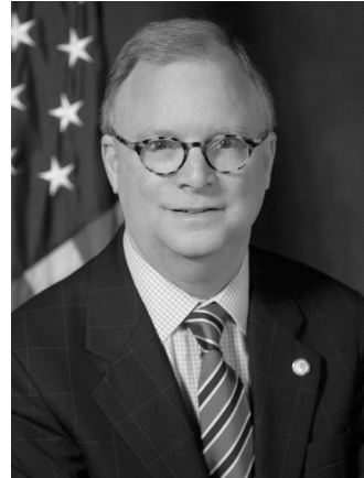
Honorable Robert L. Sumwalt

Sumwalt will join Embry-Riddle in January 2022 as Distinguished Fellow in Aviation Safety and Executive Director of the Center for Aviation and Aerospace Safety.